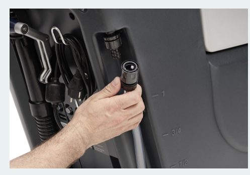
Solution hose is easy to disconnect and the solution tank can quickly be filled with water

SC530 comes in two versions: Non-traction and traction. The traction version grants easier maneuverability and allows effortless driving control for the operator.