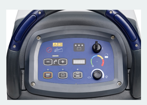
Solution flow regulation can be change from the driving position according to the floor type and level of dirt